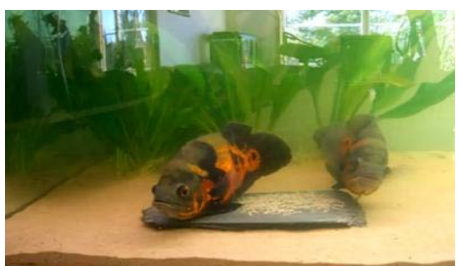
Figure 5. Egg laying of Oscar

Pairs are known to select and clean generally flattened horizontal or vertical surfaces on which to lay their 1.000 to 3.000 eggs (Figure 5) [18] and the number of eggs positively correlated with female body size [29]. The eggs adhere to a substrate and spread in a single layer. They are demersal, adherent and fragile to touch, with a slight ovoid shape, a large yolk sphere and a small perivitelline space. The fertilized eggs have a yellowish colouration and, when unfertilized, they are opaque white. Eggs hatch in 3-4 days and larva has a large yolk sac that within 4-5 days of hatching was completely absorbed [26]. Both parents continue to guard fry for several weeks [30].