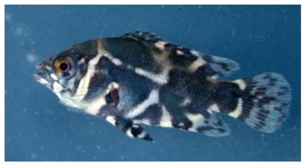
Figure 2. Young Oscar [16]

Several colour varieties produced by selective breeding for aquarium trade, especially copper/red and black mottled patterns (Figure 3) and even albino forms (Figure 4) [20].