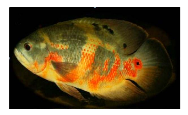
Figure 3. Normal Oscar [16]